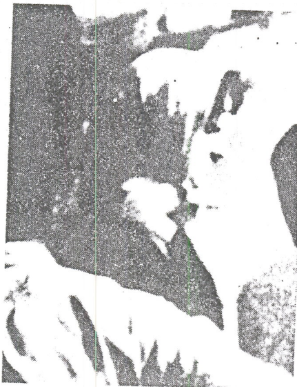
A blow-up of the Babuska Lady.