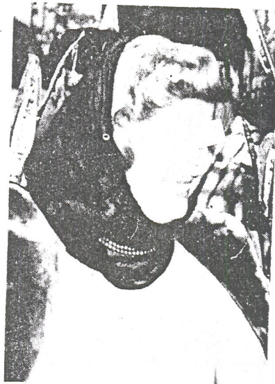
The Babushka Lady in 1962.