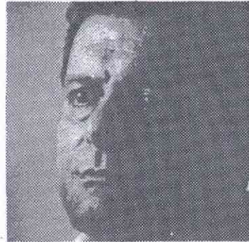
Frank Sturgis: "You can't win against the C.I.A."