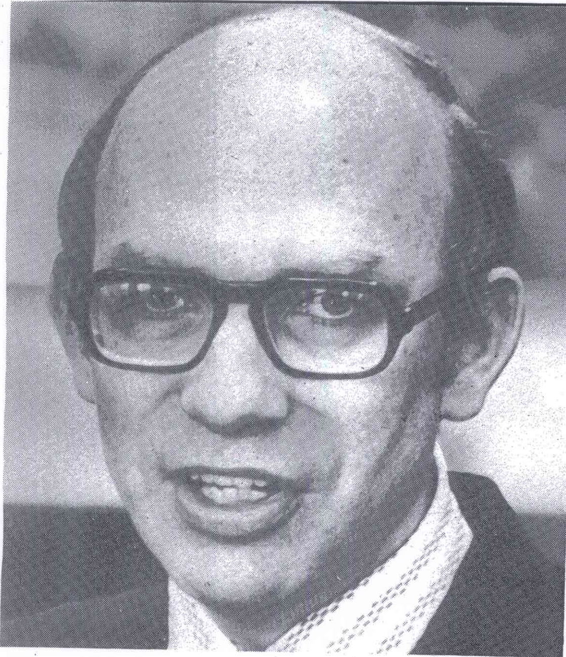
Robert F. Bennett: Loyal undercover man.

The man named. He says: 'I am a good friend of Bob Woodward'