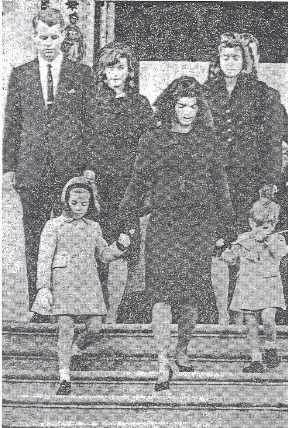
Mrs. Jacqueline Kennedy held the hands of Caroline and John, jr., as they left the capitol Sunday following ceremonies for the late president. Behind them are