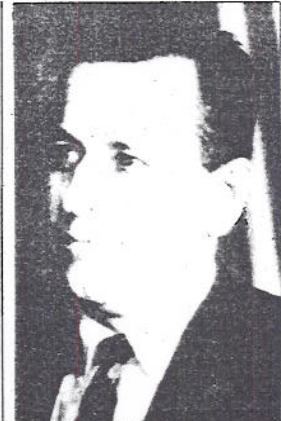
The Mysterious James Earl Ray, before and after mysterious foreign journey.

The so-called "new" information had been speeded over the wire by UPI, which had an exclusive look at 48,000 pages of FBI documents.