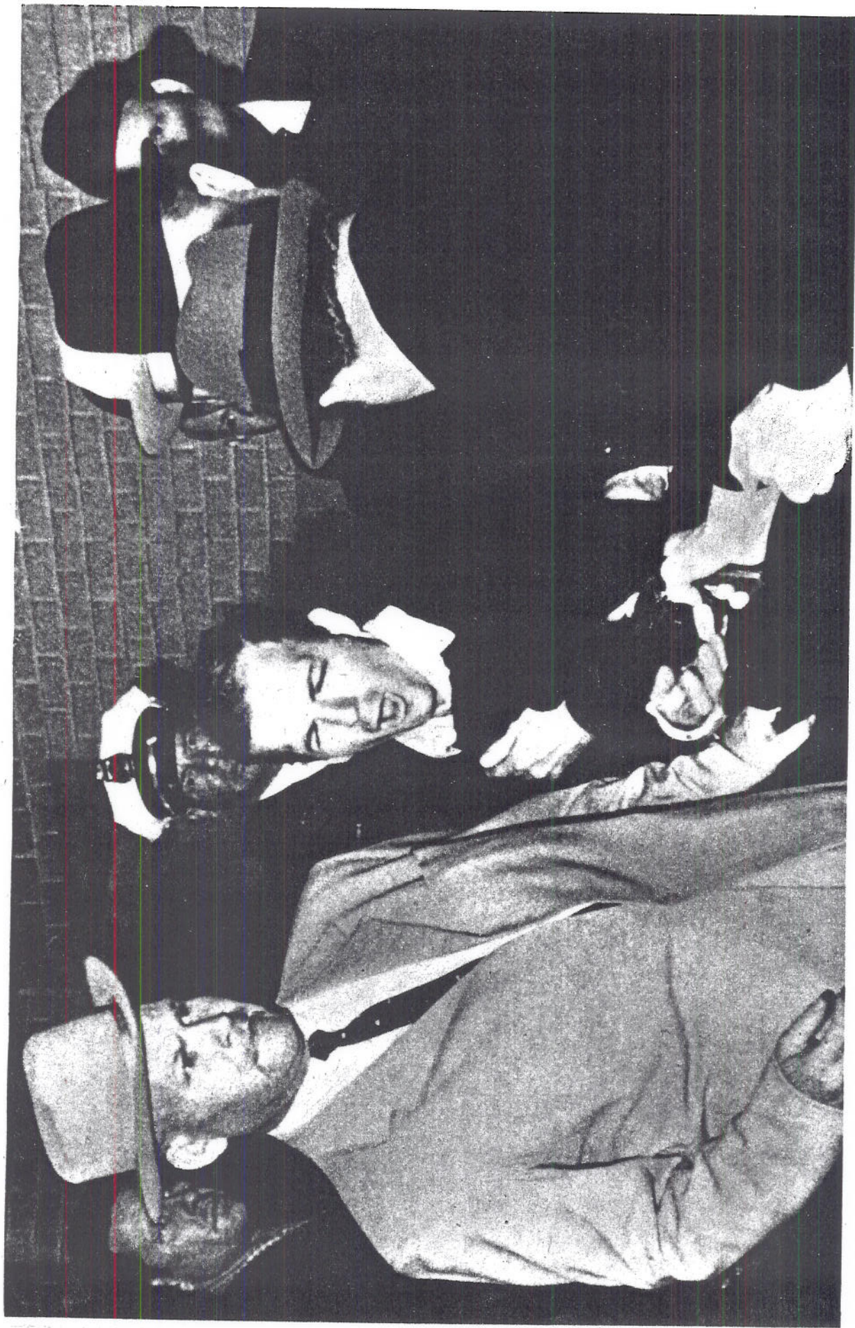
PUBLIC MURDER —While millions watched on television, unbelieving, Dallas nightclub owner Jack Ruby (back to camera) shot Lee Harvey Oswald as he was escorted through a corridor of police headquarters. To some critics of the Warren Report, the second slaying was part of one conspiracy.