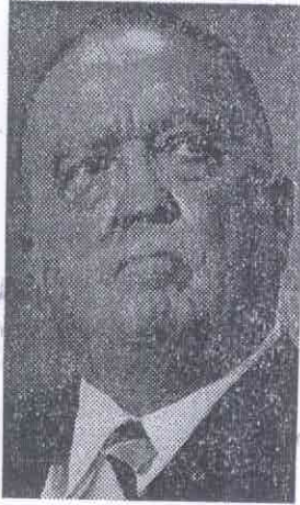
J. EDGAR HOOVER