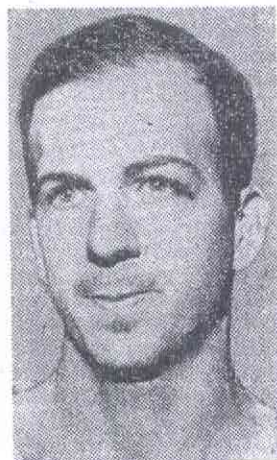
LEE HARVEY OSWALD ... in declassified papers

McCone replied that "I have determined to my sat-