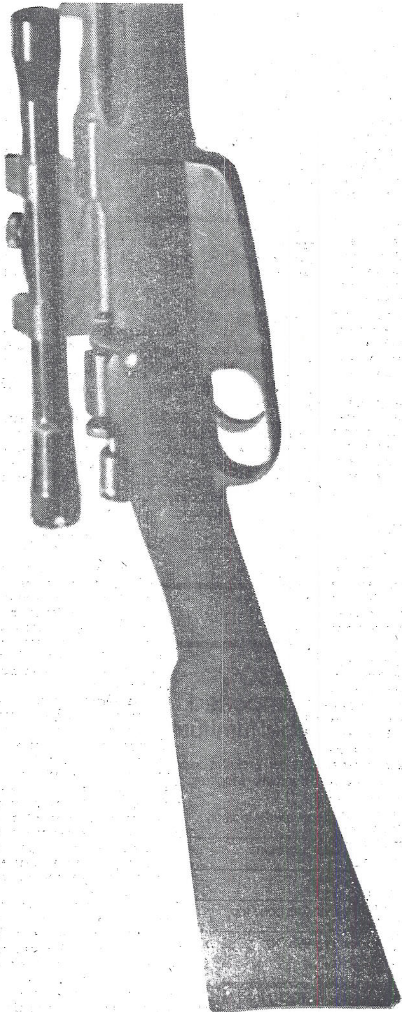
The rifle that killed President Kennedy