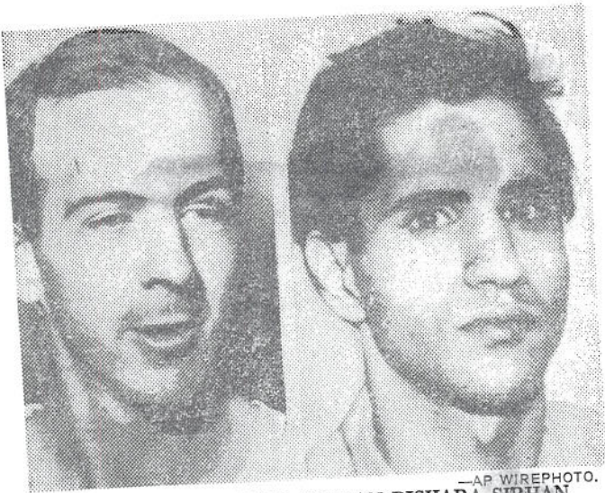
LEE HARVEY OSWALD, SIRHAN BISHARA SIRHAN The dead and the jailed.