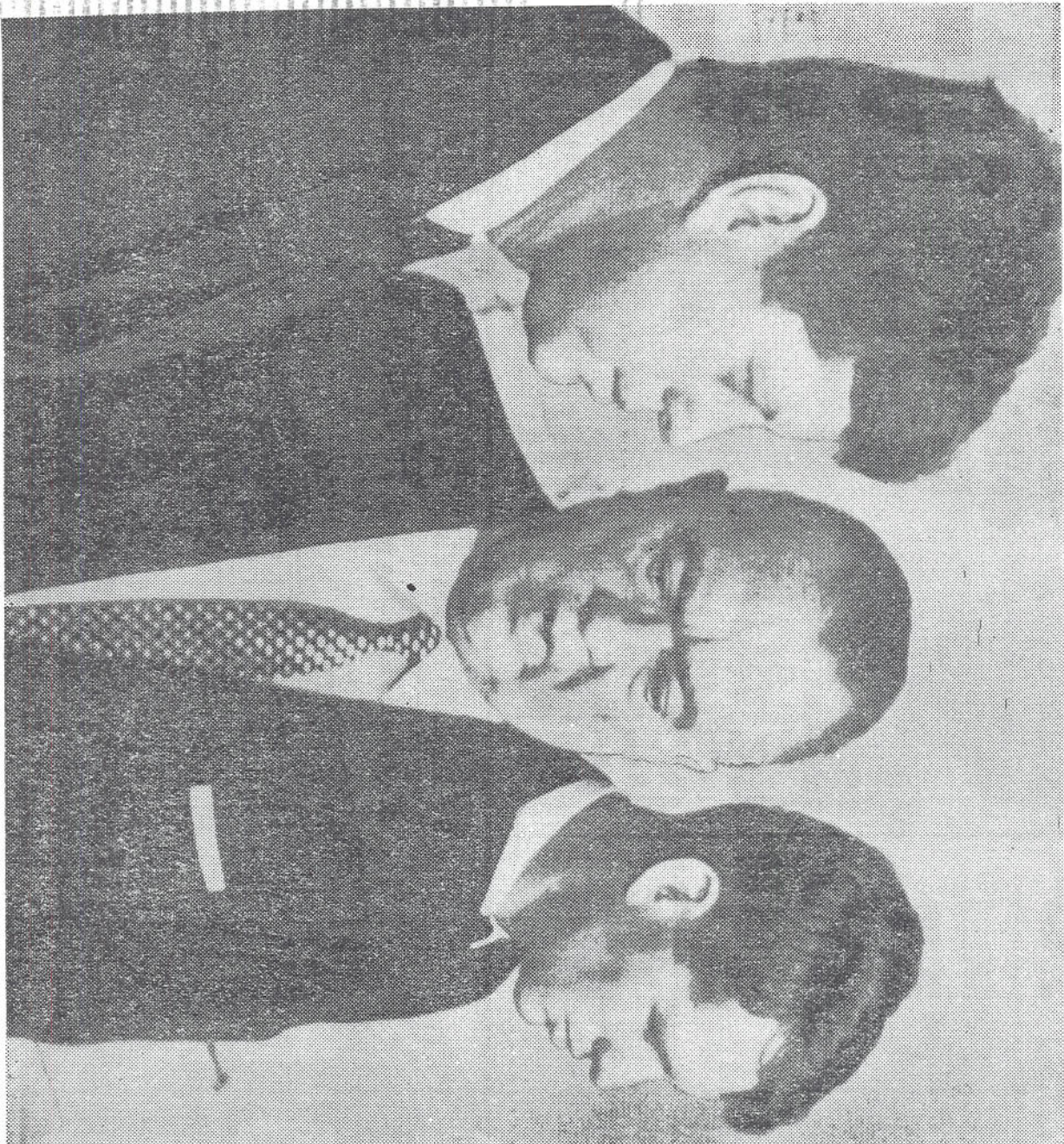
J. EDGAR HOOVER has two listeners in PRESIDENT KENNEDY and his brother, ATTY. GEN. ROBERT KENNEDY, at a White House conference on Feb. 23, 1961. It was an official visit for the head of the Federal Bureau of Investigation and the attorney general.