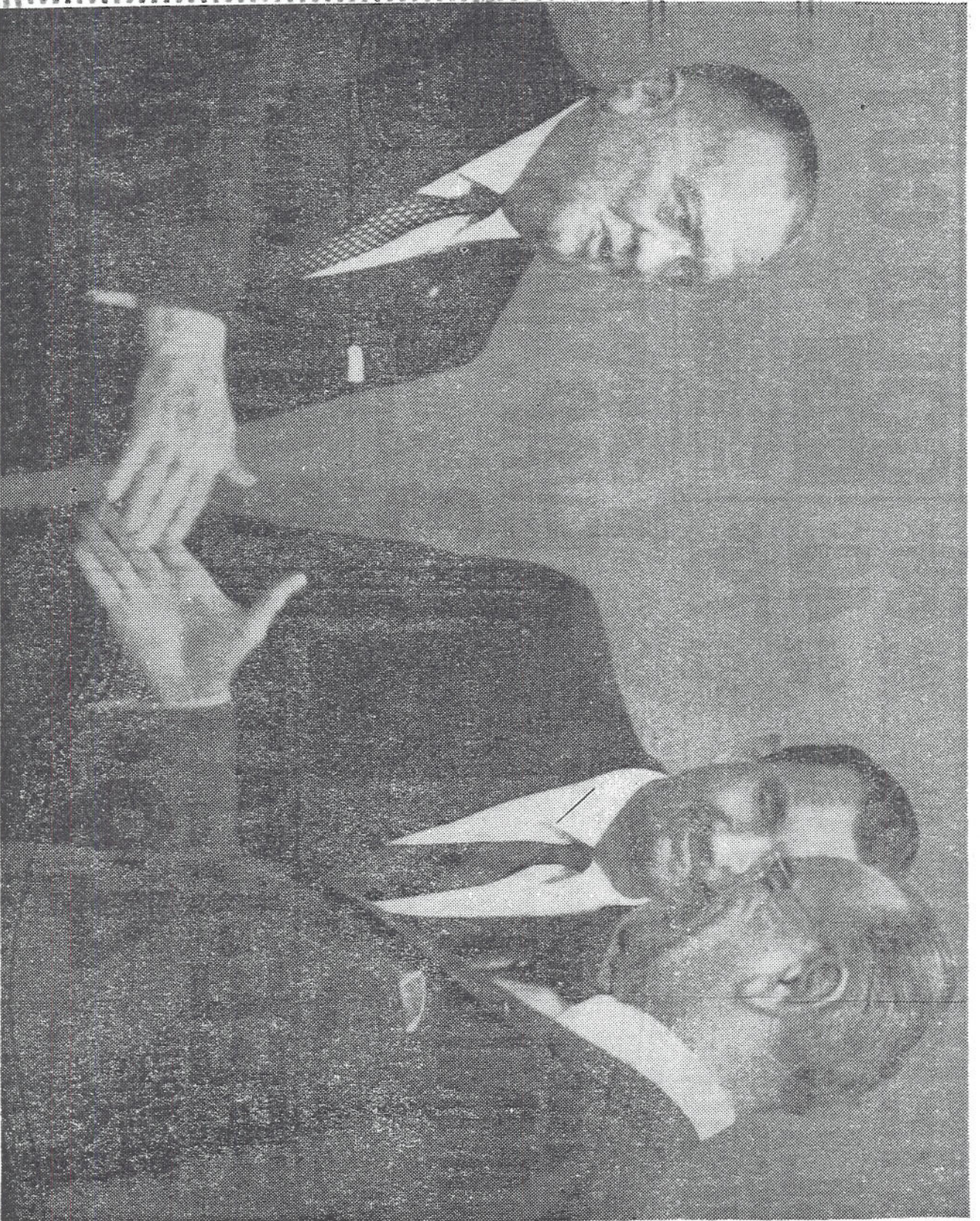
PRESIDENT JOHNSON greets the director of the Federal Bureau of Investigation in Washington in May, 1968, before taking part in a ceremony honoring teenage recipients of the Young American Medal for outstanding acts of courage and service by youth. Behind the President is ATTY. GEN. RAMSEY CLARK .