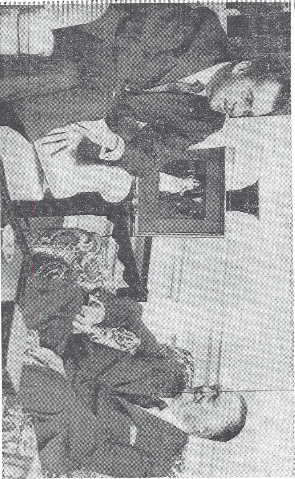
FBI DIRECTOR J. EDGAR HOOVER, who died last night, is shown during meeting with PRESIDENT NIXON in May, 1971, to discuss recent killings of police officers in New York City and Washington.