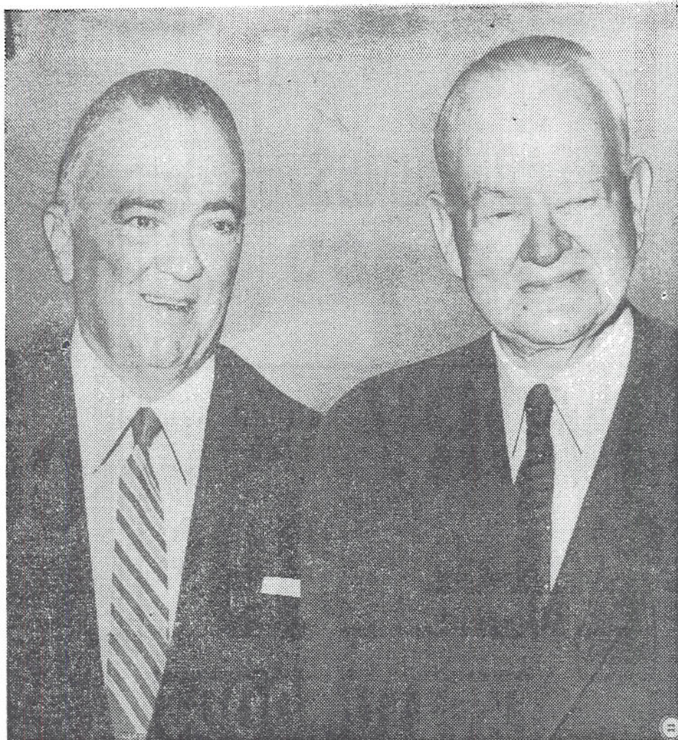
FORMER PRESIDENT HERBERT HOOVER , who named J. EDGAR HOOVER to the FBI post in 1926, poses with his friend at the annual Banshee Club luncheon for members of the American Newspaper Publishers Association in 1959.