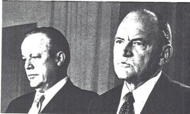
Attorney General Richard Kleindienst (l.) with Gray at news briefing. When President Nixon named him acting director of the FBI, Gray was "flabbergasted."

Come Nov. 8th, Gray will submit his resignation as acting FBI director to the winner of the 1972 Presidential race. If the winner is Nixon, Gray's name most probably will be sent to the Senate for confirmation. If McGovern wins, he could do a whole lot worse than nominating L. Patrick Gray III.