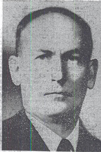
Col. Sergei Edemski, former Soviet military attache, was accused by the F.B.I.