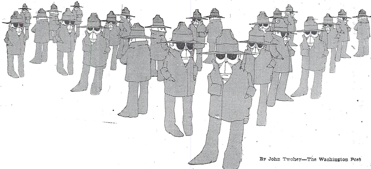
By John Twohey—The Washington Post

of 1971 the Soviets were so alarmed that they instructed the KGB to arrange a coup to eliminate Sadat from power.