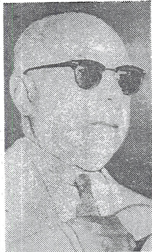
GENERAL TRUJILLO Plot Victim

24 San Francisco Chronicle Fri., June 13, 1975 ★★