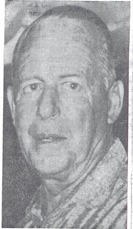
JIM THOMPSON ... missing Thai silk king

* CLIPPINGS, THIS FILE, FOLLOWING THIS DATE