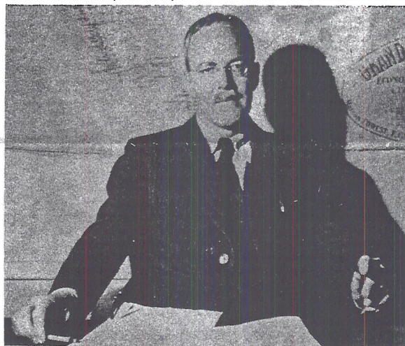
Allen Welsh Dulles, controversial OSS "master spy" in neutral Switzerland later director of the CIA. His wartime network stretched throughout Europe and into the heart of Hitler's Third Reich.

fluke. It's not really a function that they're oriented toward conducting, and it's something I think they'd just as soon get rid of.