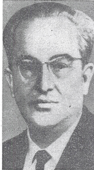
Yuri V. Andropov

The agency prints its own house organ, called Chekistsky Sbornik. The magazine has a select and limited circulation.