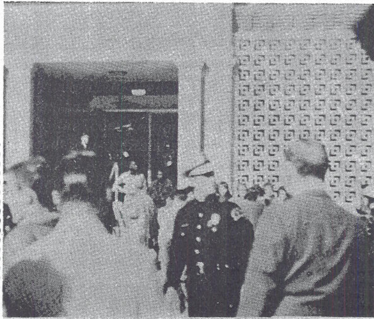
WILLIS EXHIBIT No. 1—Continued (Slide No. 8)