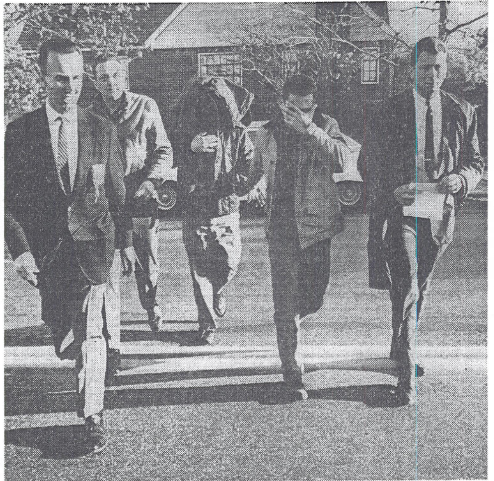
SUSPECTS: Men arrested in raids hide faces approaching Fresh Meadow station in Queens

Under questioning he repeatedly refused to give details about the camps, on the grounds that the entire matter was subject to "continuing investigation" and had not yet gone before the grand jury. It was only after a reporter asked him if the targets were Boy