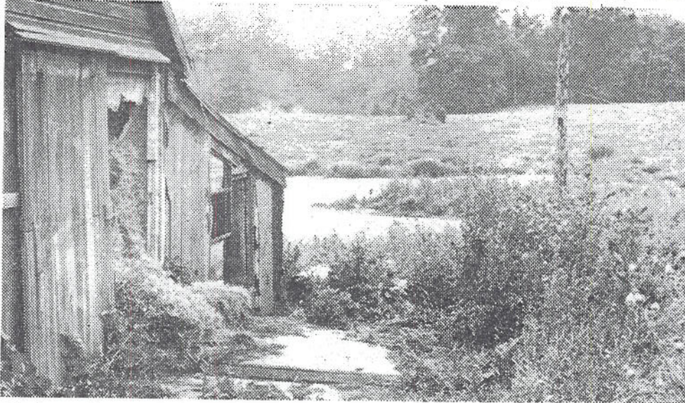
The barn where a raiding party found 12 cases of dynamite hidden under mounds of hay