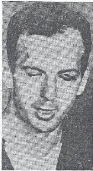
LEE HARVEY OSWALD

numbers of Americans uttered the preposterous exclamation, "Jefferson Davis!"