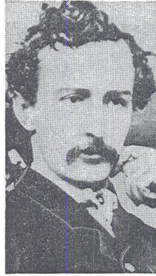
JOHN WILKES BOOTH