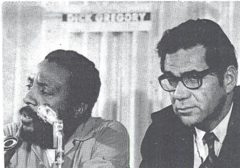
Dick Gregory and Mark Lane announce their candidacy for President and Vice President on an independent national write-in ticket. The announcement was made in Chicago. Hours later Gregory and Lane led a march of several thousand demonstrators and 95,000