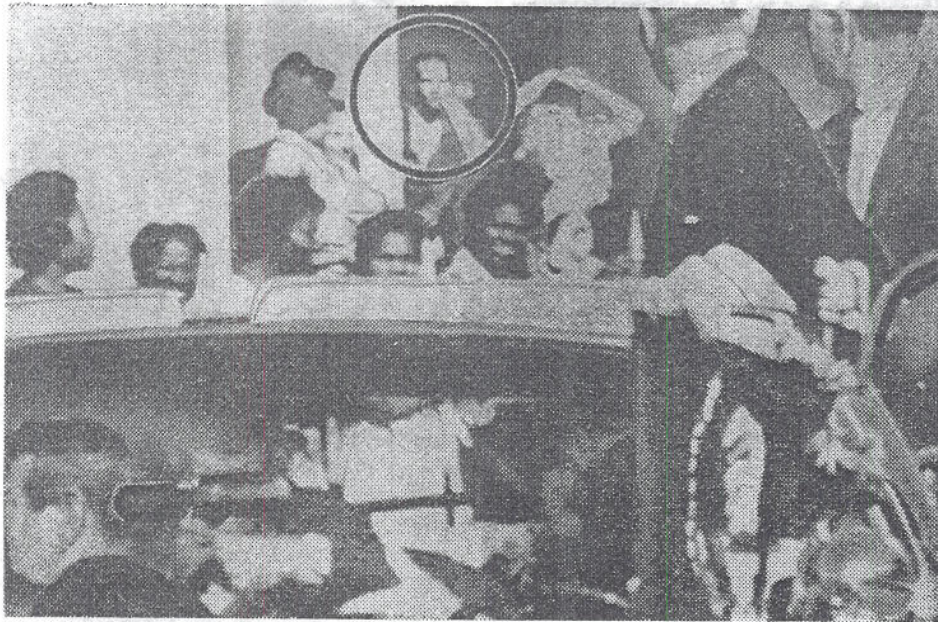
ALTGENS' PHOTO OF THE BOOK DEPOSITORY STEPS