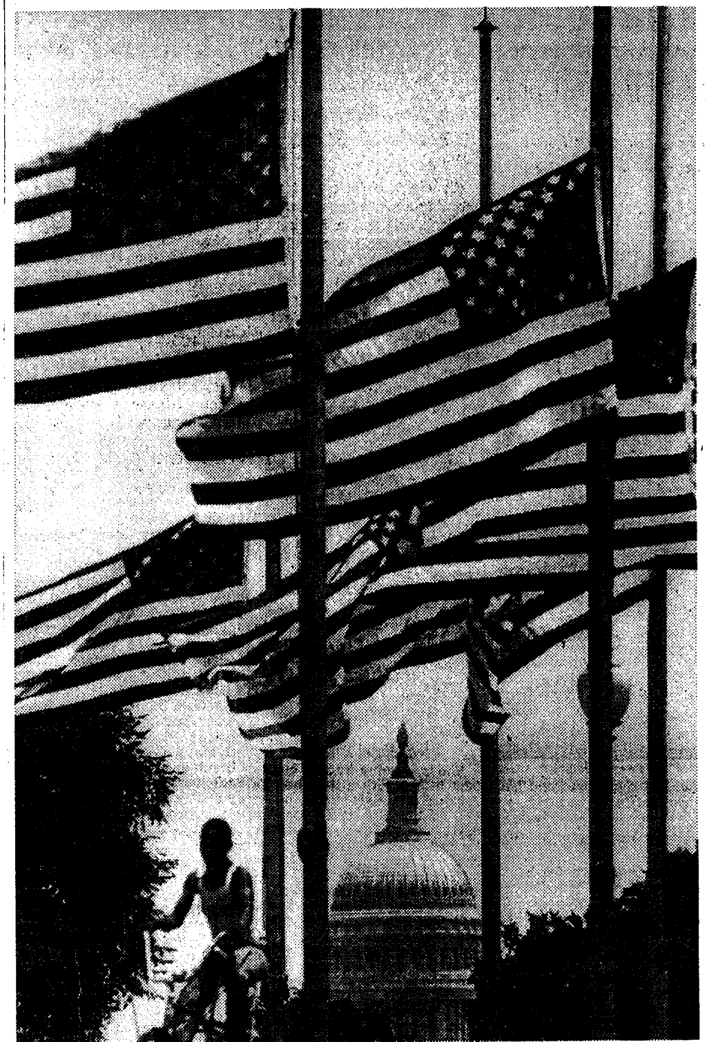
IN WASHINGTON: Flags encircling Washington Monument are at half-staff in tribute to Robert F. Kennedy. Site is near camp of Poor People's Campaign. Capitol is at rear.

Mr. Katzenbach, who succeeded Mr. Kennedy as Attorney General, was organizing the final service here, along with Robert S. McNamara, president of the World Bank, whom the Kennedy family has placed in charge of all funeral arrangements.