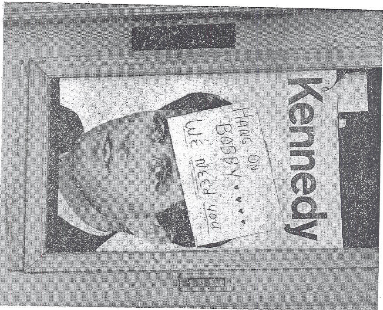
Kennedy for President headquarters at 59 Grand Avenue in Oakland was quiet today. A hand-lettered sign implored stricken candidate to 'hang on.'