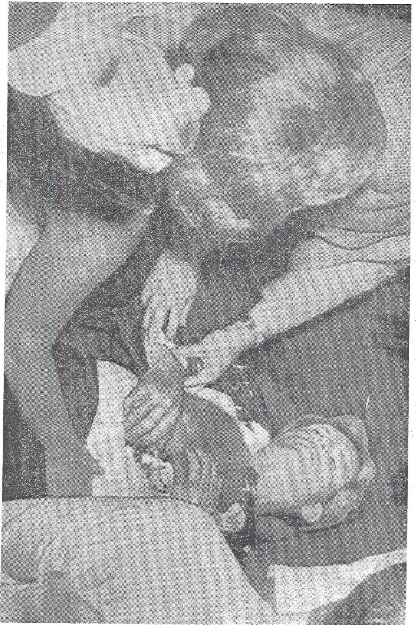
Clutching rosary beads given him by a priest, Robert Kennedy lies, one eye open, as his wife comforts him