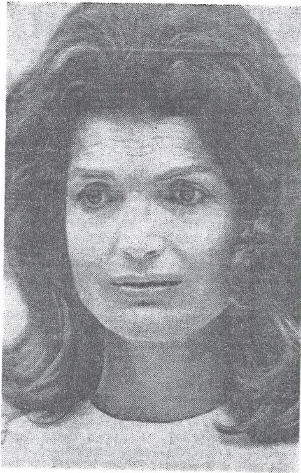
Jacquelin Kennedy Onassis witnessed the service