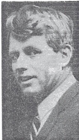
ROBERT F. KENNEDY Was he Mr. X?

"Marilyn in her last year was frequently seen — giggling under her black wig — boarding one of the Kennedy