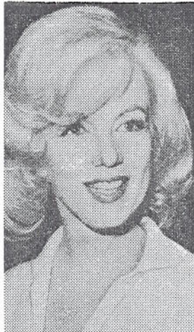
MARILYN MONROE "Slurred voice"