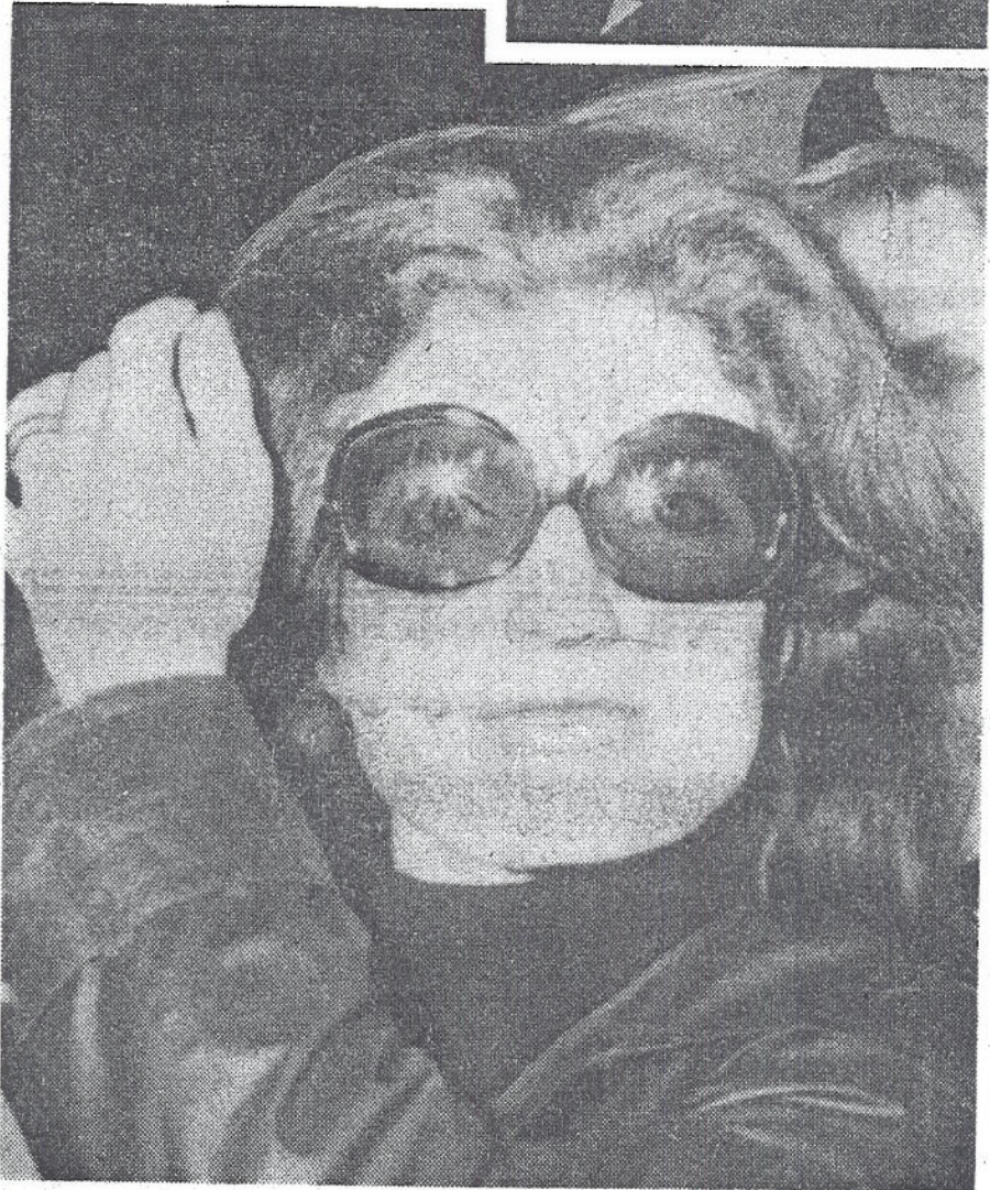
Jacqueline Onassis leaves New York en route to Paris

Family friends said the "obvious" site was next to the grave of his son Al-