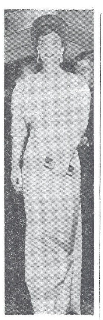
In 1961 poll, Jackie was voted "best dressed"