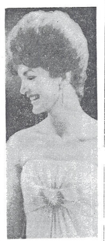
Special arrangement with Cassini for Latin tour