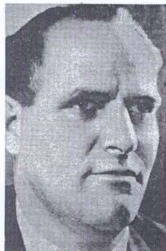
ERVIL LeBARON: Early photo of the man sought by the FBI.

The spokesman warned that LeBaron "should be considered armed and dangerous," and that "extreme caution" should be used in dealing with him.