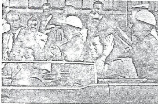
JFK RIDING IN MOTORCADE in Dallas next to wife Jackie and behind Governor and Mrs. John Connally of Texas. Only seconds later, the President was shot.

The shocking discrepancies uncovered by the new evidence appearing in The ENQUIRER can mean only one thing, says