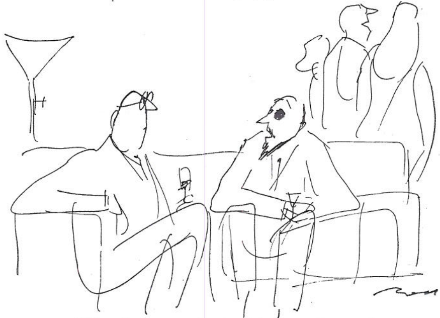
"There I was, armed only with my intellect . . ."