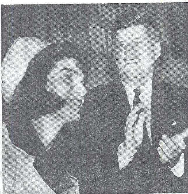
President Kennedy applauded as Jackie was introduced at Chamber of Commerce breakfast at Fort Worth.