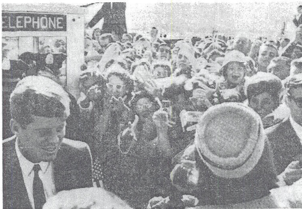
JFK—MOMENTS BEFORE THE ASSASSIN STRUCK The President was given an enthusiastic reception at the Dallas Airport