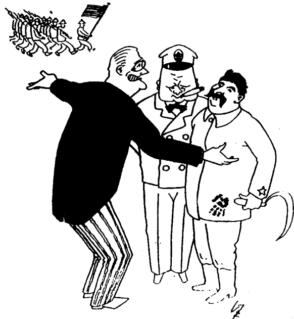
F. D. R.—"I can get 'em for you wholesale."