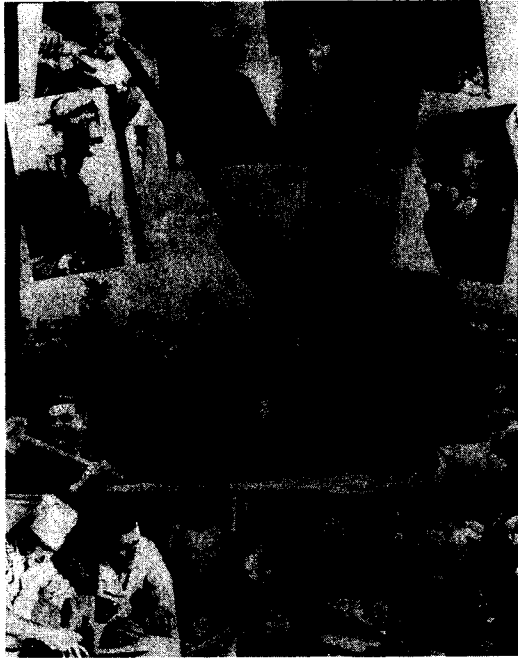
A layout of war pictures found in an "Illustrated Supplement of the German Notebook of War", printed in Spanish, and widely distributed in Mexico. This group of shots shows the men responsible for the operation of a big anti-aircraft gun. These pictures were selected to overawe gullible Latins with German might.