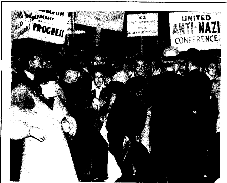
Riot scene in front of Los Angeles German House during convention of Bund's so-called "Anti-Communist Federation of America". Such demonstrations ceased abruptly after Berlin-Moscow Pact was signed. Repetitions are expected now!