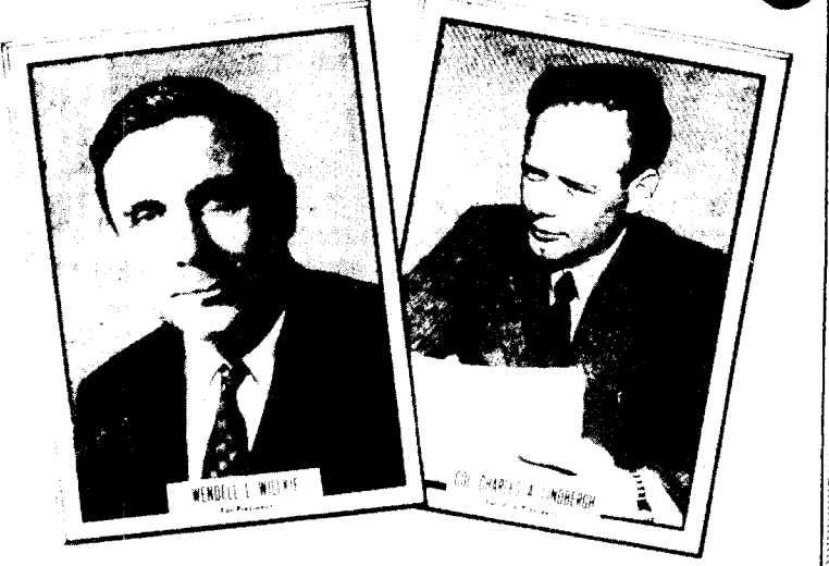
AS THESE LINES are written Republicans are gathering at Philadelphia for an historic convention. In the time this edition is in the readers' hands, the choice of Presidential nominees will likely have been made.