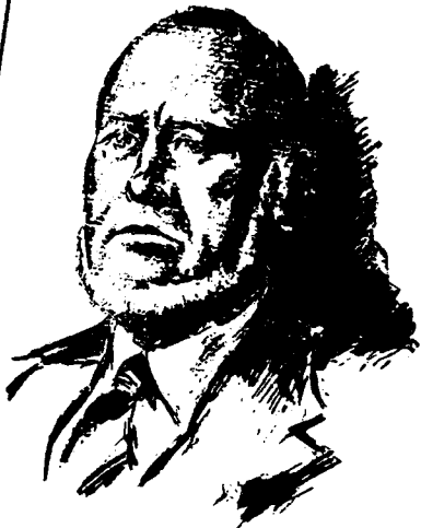
Genl. MANIE MARITZ