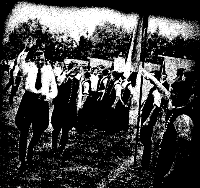
Speakers are greeted in Nazi style