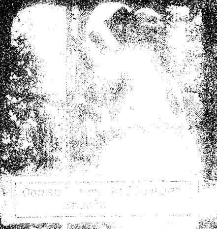
Heart-shaped floral arrangement