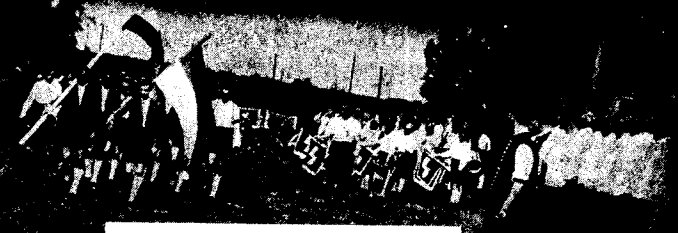
Youth Group Marches