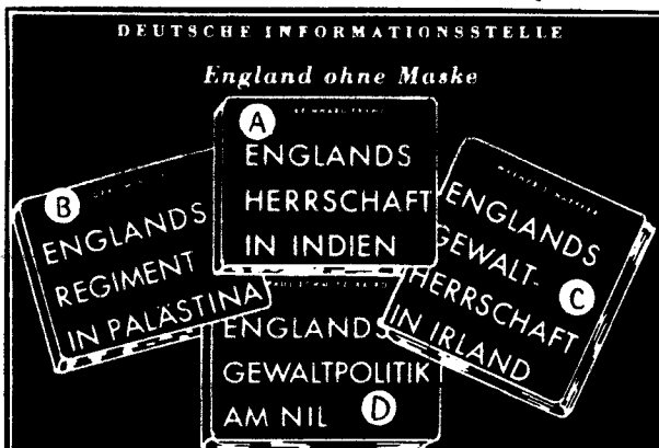
Front covers of new Goebbels publications, "exposing British iniquities". These volumes -- first four of a comprehensive series -- are issued by "Deutsche Informationsstelle" (German Information Office) and entitled, respectively (a) "Englands Herrschaft in Indien" (England's Rule in India); (b) "Englands Regiment in Palastina" (England's Government in Palestine); (c) "Englands Gewaltherrschaft in Irland" (England's Rule by force in Eire); (d) "Englands Gewaltpolitik am Nil" (England's Power Politics on the Nile).

Each one of the Flanders Hall volumes contains a bibliography, giving titles of English books from which material was culled. However, the true source of all this material -- the Deutsche Informationsstelle (German Information Office) -- naturally is kept secret. This organization was exposed in NEWS LETTER of July 17, 1940 (illustration on this page) as an official Nazi propaganda agency which sends large shipments of expensive propaganda booklets into the United States.