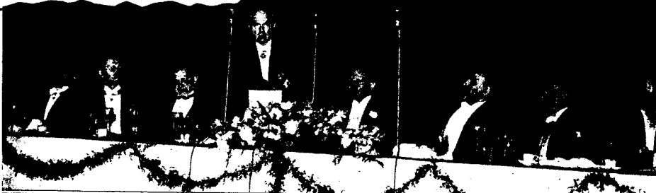
The late U.S. Senator Ernest Lundeen fraternizing with Hitler emissaries.