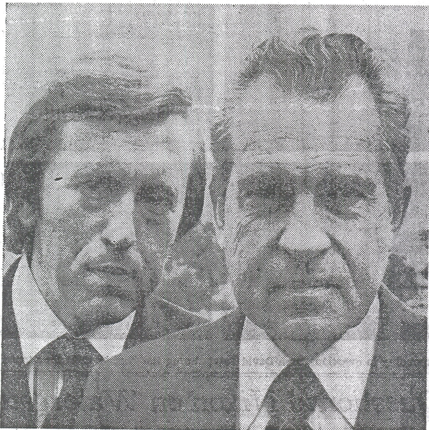
David Frost and Richard M. Nixon, the former President in San Clemente, Calif.

limited, and then you're going to rely on that document, and so you're going to be able to blame it on Dean. And, it seems to me that, that is consistent with all the quotes that I have quoted, and not the open-door quote that you have quoted.