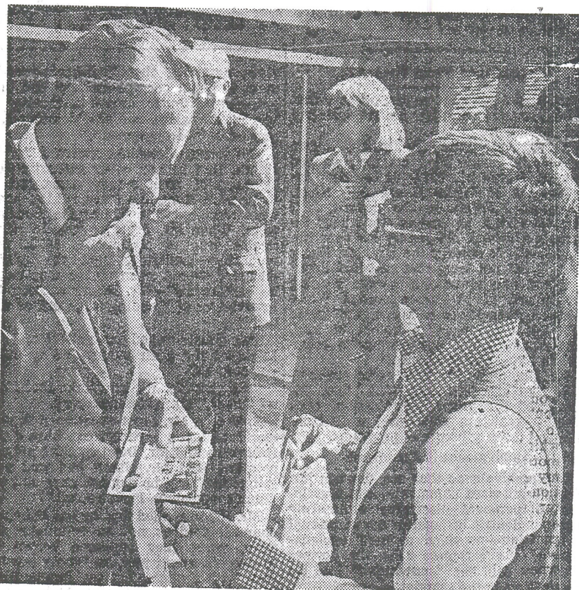
Mr. Nixon autographing a picture of himself taken by a neighbor