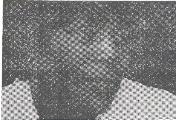
Cicely Tyson, top left, took a 10-day break from filming "The Blue Bird" in Leningrad and flew to Los Angeles to co-star in the movie version of "The River Niger."