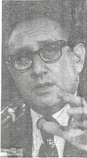
HENRY KISSINGER ... affidavit filed

Secretary of State Henry Kissinger has continued to portray his role in the Nixon administration wiretaps on government officials and newsmen as minor, and says he "cannot explain" why an official FBI document indicates that he ordered one of the taps to remain in operation.