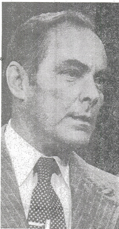
ALEXANDER M. HAIG JR. ...acknowledges discussions

Buchanan confirmed yesterday that he, too, had urged Haig to bring up the matter of a pardon with Mr. Ford and that af-