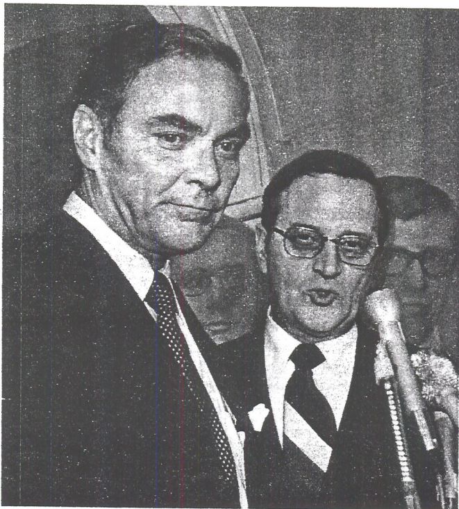
It was Haig who finessed arrangements in the last days of Nixon's Administration so that Nixon reluctantly but finally agreed to resign. It was by then clear to Nixon

"How Al Haig got Richard Nixon to decide that Richard Nixon must resign is, to my way of thinking, one of the most skillful, tactful, diplomatic, brilliant and sensitive feats in American history.