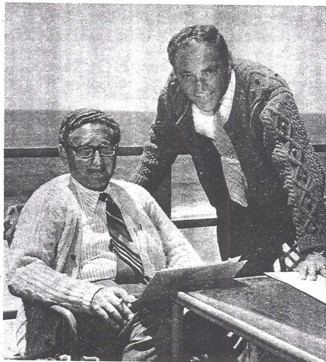
that if the Senate tried him, he would be found guilty. Two of Nixon's staunchest loyalists, Buzhardt, shown with Haig (l), and Kissinger (r), were also convinced of that.