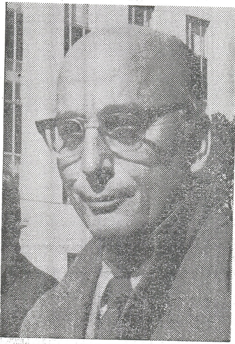
The New York Times, United Press International, ABC News and Associated Press