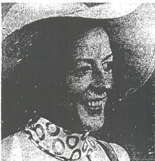
Actress Maggie Smith may have found "new happiness"