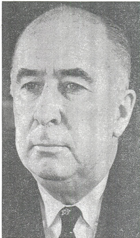
JOHN N. MITCHELL ... "I'm going to the moon"