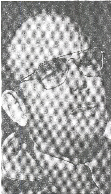
JOHN D. EHRLICHMAN ... "it changes nothing"