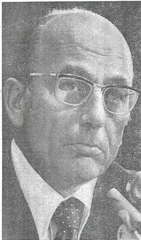
ROBERT C. MARDIAN ... seemed stunned