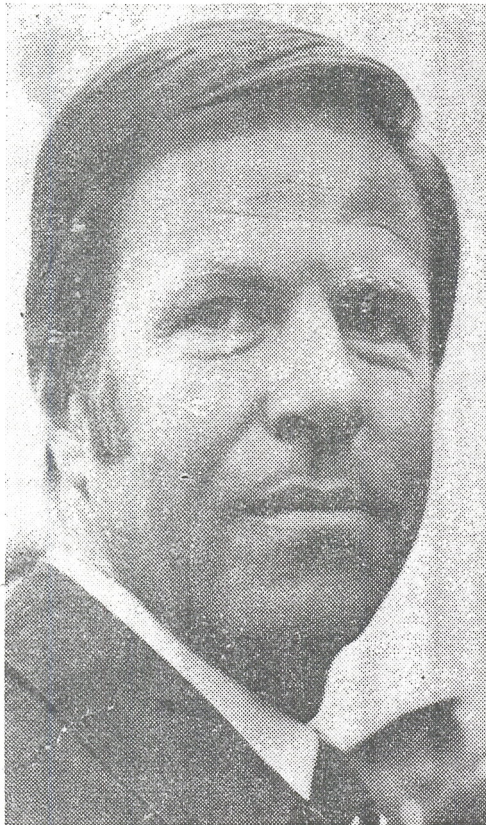
H. R. (BOB) HALDEMAN ... "I'm totally innocent"