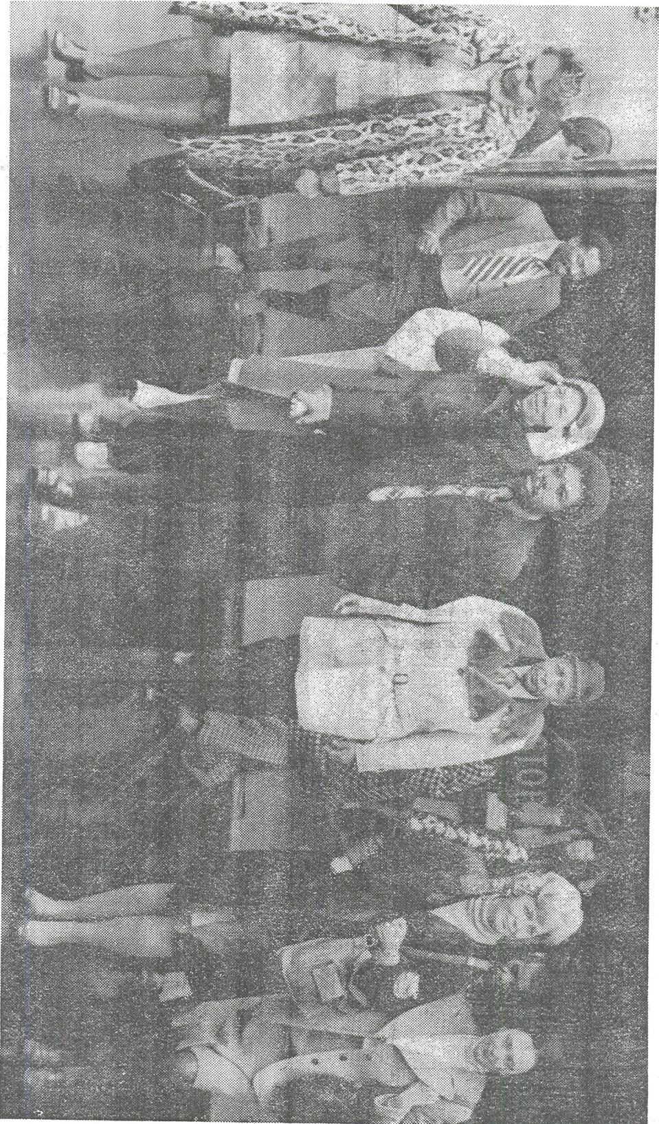
Members of the Watergate cover-up jury and court officials leaving for lunch break on second day of deliberation.