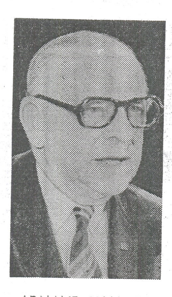
ARMAND HAMMER Campaign contributor