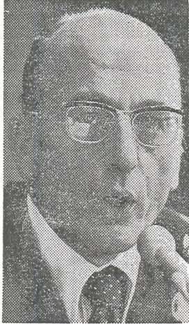
ROBERT C. MARDIAN ... said to offer theories